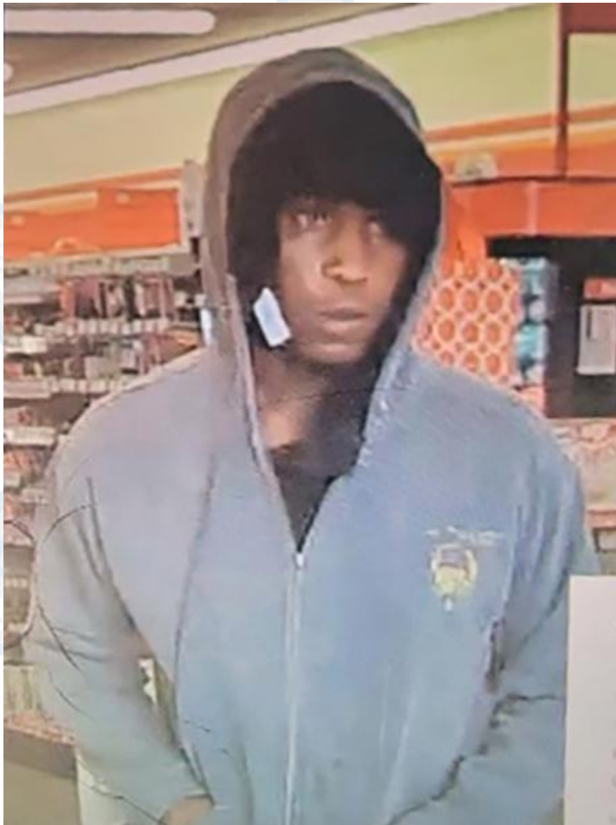
A surveillance image shows a person believed to be the same suspect from the Sonny's robbery but at another location.