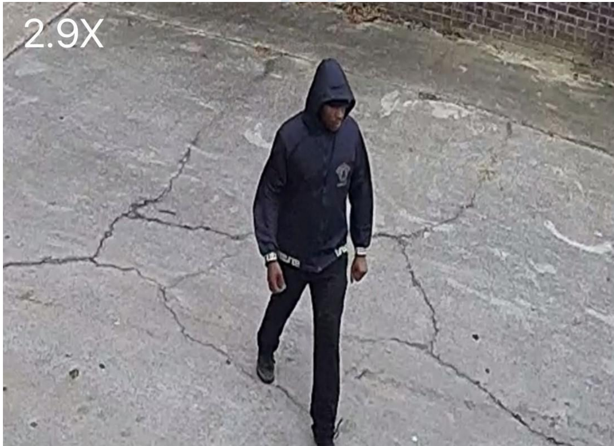
A surveillance image shows the suspect in the Sonny's robbery.