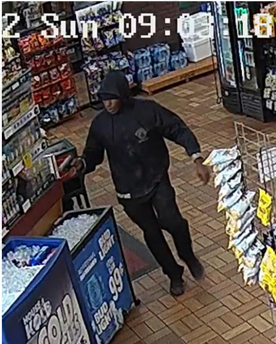
A surveillance image shows the suspect in the Sonny's robbery.

Anyone with knowledge of the person's identity can reach CCSO's Investigations Division at 843-529-6207 or call the main non-emergency number at 843-202-1700. Anyone wishing to remain anonymous can call Crime Stoppers at 843-554-1111.