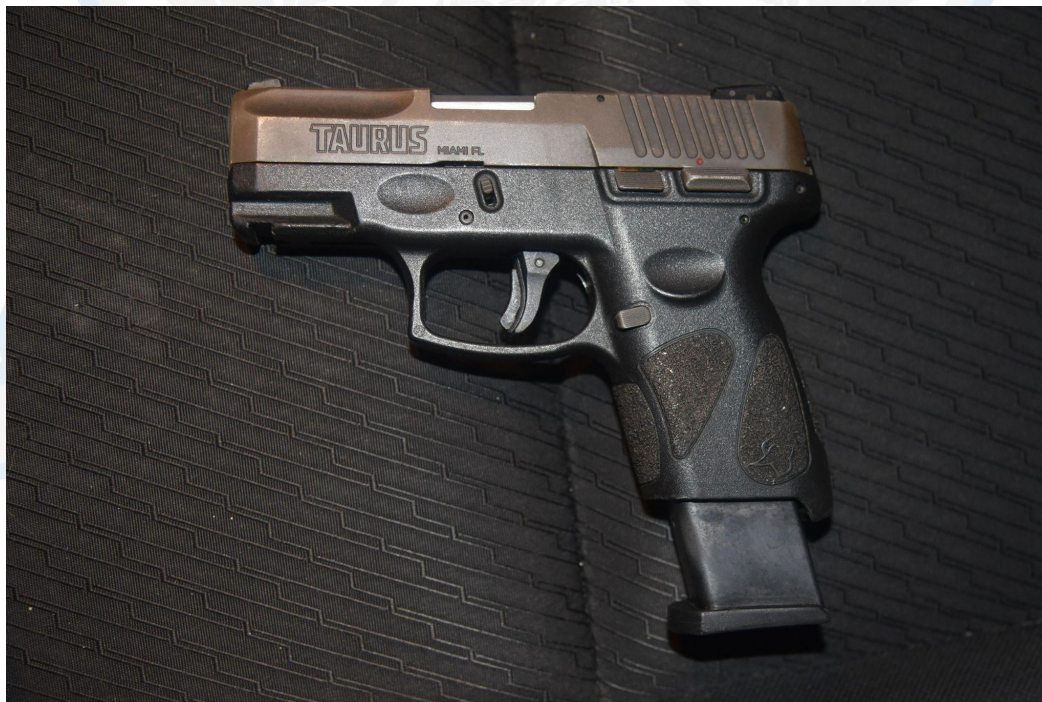
Handgun recovered at the scene.

CCSO's policy on the use of deadly force, including provisions for warning shots, is attached. The deputy who fired the shot remains on full-duty status.