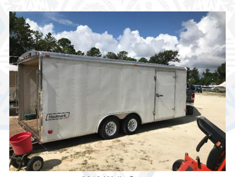
2012 Wells Cargo.