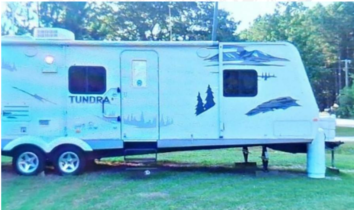
Travel trailer stolen in December.