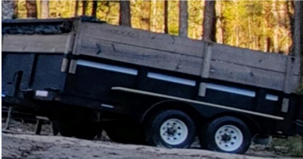
Trailer stolen Jan. 8.